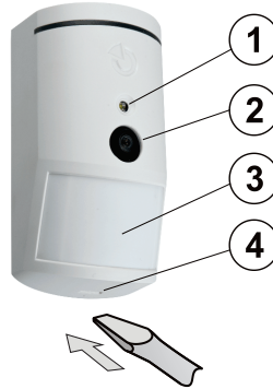
Figure: 1 – flash for illumination; 2 – camera lens; 3 – PIR detector lens; 4 – cover tab;

The detector can be installed on the wall or in the corner of a room. There should be no objects which quickly change temperature (e.g. heating appliances) or which move (e.g. curtains hanging above a radiator, robotic vacuum cleaners) or pets in the detector's field of sight. It is not recommended installing the detector opposite windows or in places with intense air circulation (close to ventilators, heat sources, air conditioning outlets, unsealed doors, etc.). There should be no obstacles in front of the detector which might obstruct its view of the protected area.